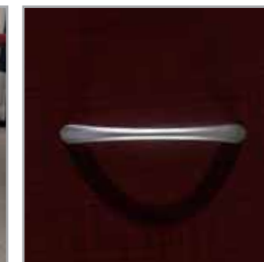
Contemporary bow shaped handles are standard on all drawers and doors and are offered in Silver or Black Nickel